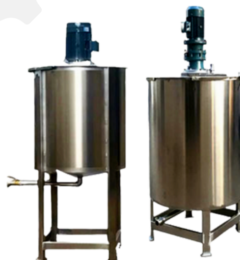
Process Reactor and Mixing Tanks